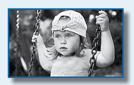
SEE INSIDE TO LEARN HOW YOUR DONATION IS TAX DEDUCTIBLE!